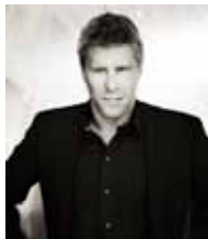
CEO & Senior analyst - QNB Volante Stockholm, Sweden tn@qnb.se

Project name: The most cultural or creative regions in Europe? Picking the right definition for policy-making